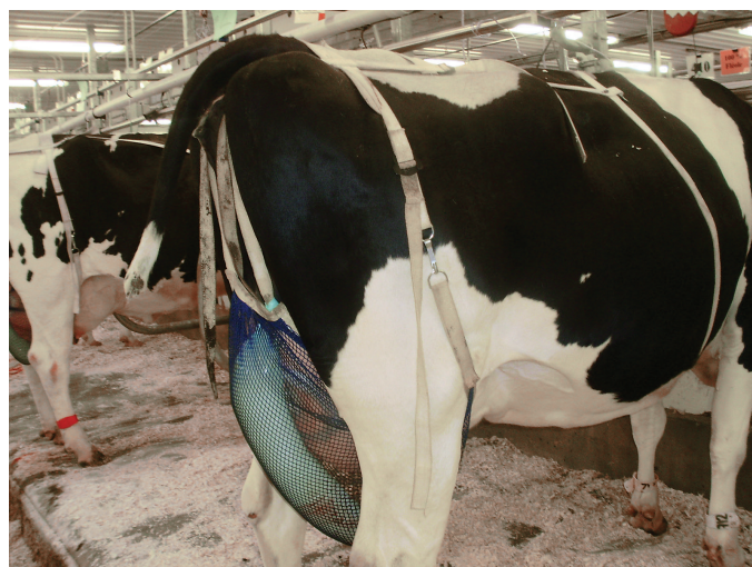
Figure 2. Ice applied to the biopsy site using a cow bra.

All animals were cared for in accordance with the guidelines of the Canadian Council on Animal Care (5) and all biopsy procedures were approved by the local Animal Care Committee. Individual observations of 16 Holstein cows from 2 separate lactating cow-feeding trials carried out as replicated 4 \times 4 Latin-square design were used. The trials were conducted in the same year with different treatment diets and using different cows. Details on dietary treatments and experimental procedures of experiments 1 and 2 have been published previously (6,7, respectively).